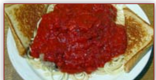
Spaghetti & Meatballs