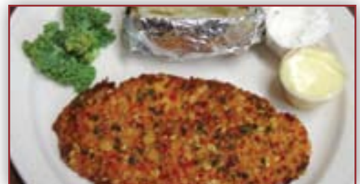
Tilapia Tortilla Crusted

The above dinners include: French fries and creamy coleslaw