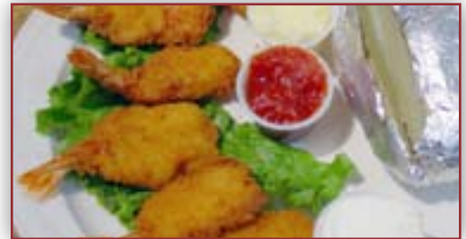
Breaded Fantail Shrimp