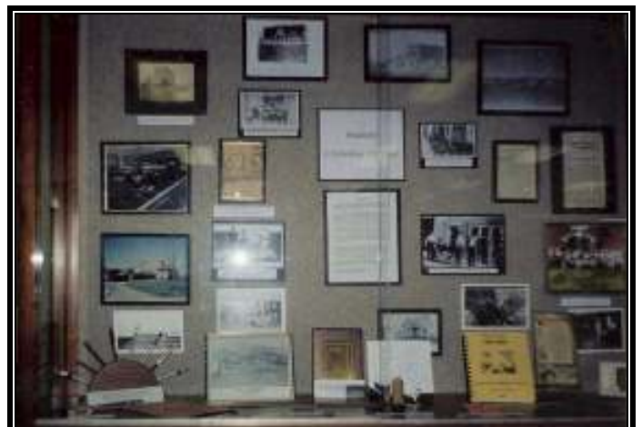
Bradford display at FCHS Museum