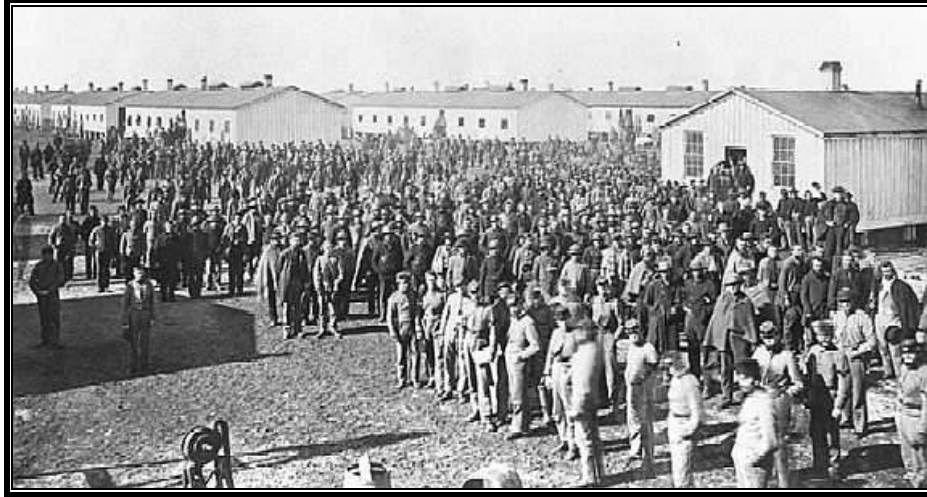
Camp Douglas, Chicago Illinois

The answer was published in Victoria Crossroads of South Texas , in 1991, a list of 13 Federal prison camps and 21 Confederate camps.