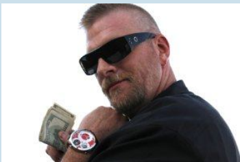
Schwag will be joining us on the ride & as MC of 2009 Iowa B.A.D. Ride II

Former host of "Monster Garage" and current host of "Pass Time" on the Speed Channel